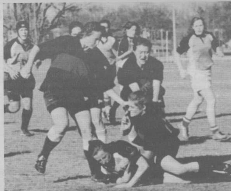
Rugby is a rough-and-tumble game and not for the faint of heart..