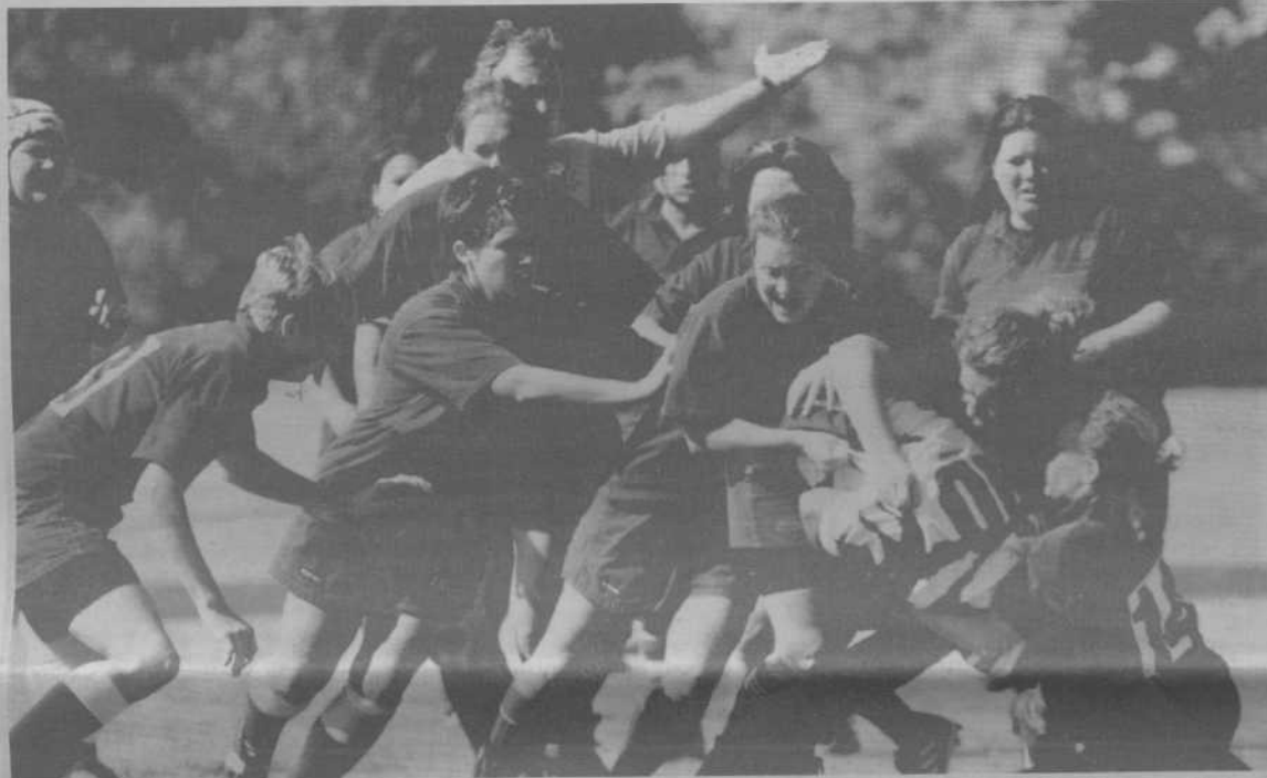
Players of the Memphis Lady Blues rugby team batter it out in a recent game.